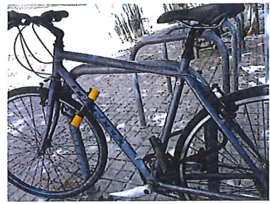
Using two U Locks

See below for recommended method of securing a E-scooter to a bike rack by securing the u-lock on the folding arm between the stem and the deck. Exact placement and hooks may vary by manufacturing type.