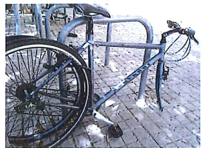
Using one U Lock for both tires